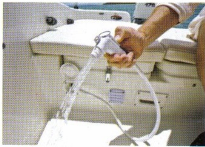
ABOVE: Shurflo deck-wash is standard.